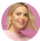
Sophia Amoruso, Serial Entrepreneur & NYT Bestselling Author of GirlBoss

This book is a powerful compass for embracing risk and creativity in all aspects of life. Chase shows us how to step out of our comfort zones and become who we were meant to be.