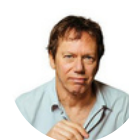
Robert Greene, author of The 48 Laws of Power

Whoever tells you that the 'safe' path is the better path doesn't understand how things work. Never Play It Safe serves as a radically simple blueprint to reclaim our creativity and personal power.