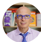
Seth Godin, author Song Of Significance

Trust yourself. No one else can do that for you. Chase Jarvis is a maker of magic and a weaver of possibility, and this book can unlock the future for you, if you'll let it.