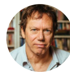
Robert Greene, author of The 48 Laws of Power

Whoever tells you that the 'safe' path is the better path doesn't understand how life works. This book is a radically simple blueprint to reclaim our creativity and personal power.