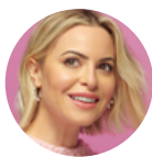
Sophia Amoruso, Author of GirlBoss

This book is a powerful compass for embracing risk and creativity in all aspects of life. Chase shows us how to step out of our comfort zones and become who we were meant to be.