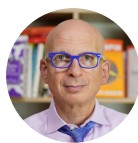
Seth Godin, author of The Dip